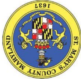
Commissioners of St. Mary's County