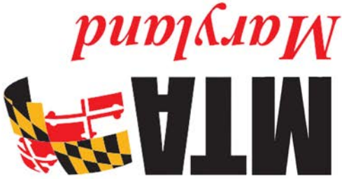
Maryland Transit Administration